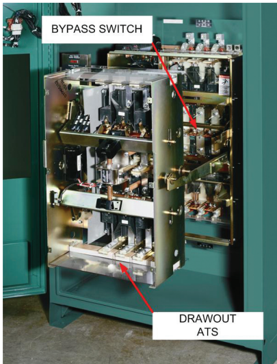
FIGURE 2: Bypass/Isolation transfer switch.

bypass is engaged, the ATS is drawn out, the repair is accomplished, the ATS racked in, and the manual bypass is disengaged. All this occurs without any type of disruption to the loads. The problem: an ATS with bypass costs 2-3 times more than a simple ATS, and takes up more space.