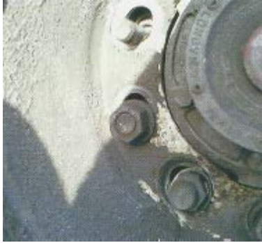
Elongated Stud Holes