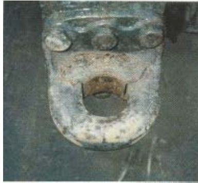
Improper Welds on Pintle Hook