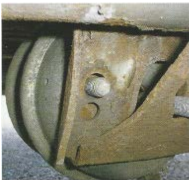
Loose Brake Chamber