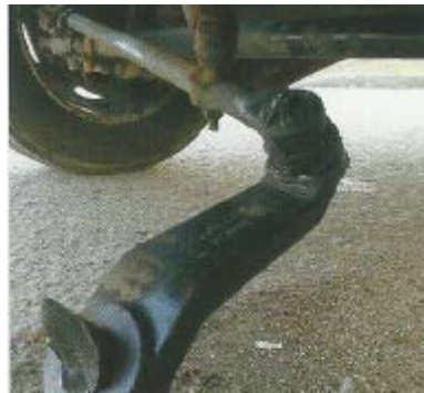
Cracked Steering Pitman Arm