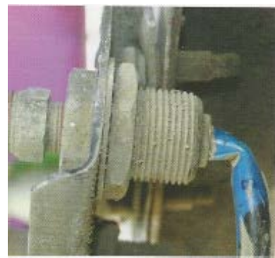
Crimped Brake Hose