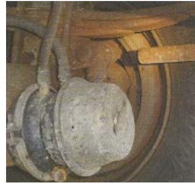
Broken Radius Rod