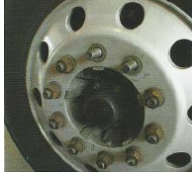
Missing Lug Nuts