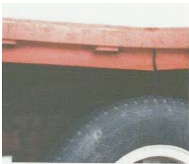
Cracked Trailer Frame Member Frame Member