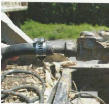
Improperly Spliced Brake Hose