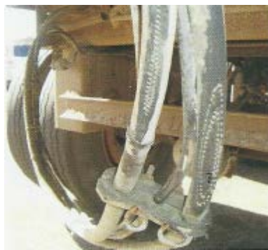
Badly Worn Brake Hose