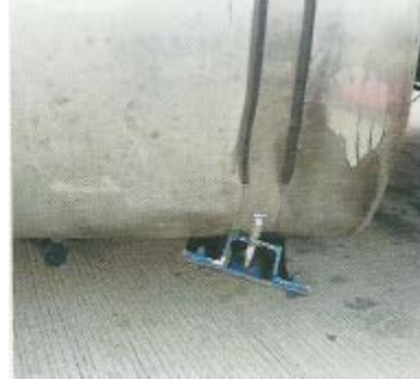
Improperly Secured Fuel Tank