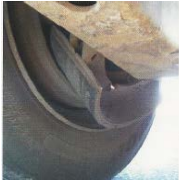
Absence of Braking Action