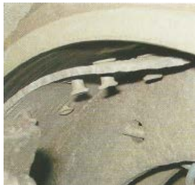
Brake Pad Missing