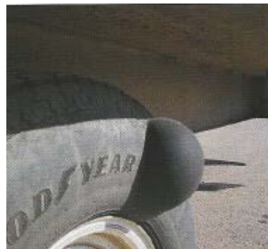
Tire with Sidewall Separation