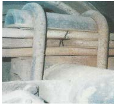
Broken Leaf Spring