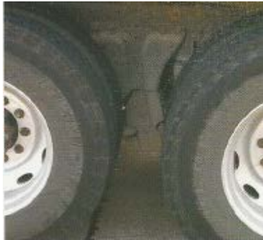
Broken Spring Hanger