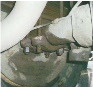
U-Bolt Missing Fastener