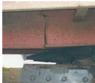
Cracked Trailer Frame Member