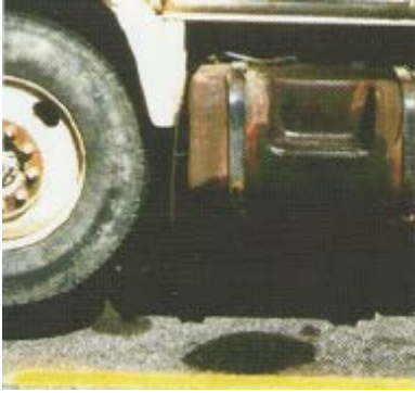
Fuel System Leak