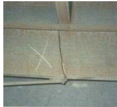
Cracked Frame Member