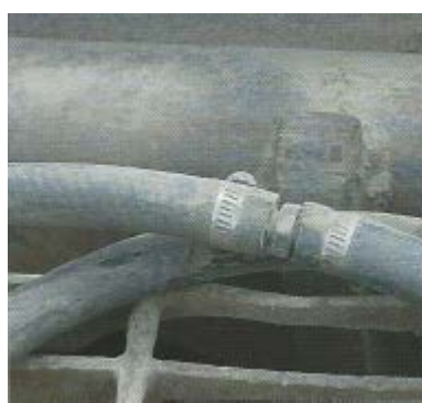
Improperly Spliced Brake Hose