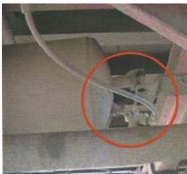
Loose Air Reservoir Tank