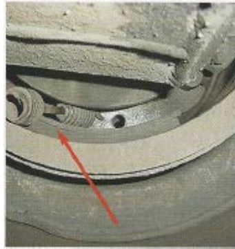
Broken Brake Return Spring