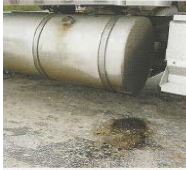
Fuel System Leak