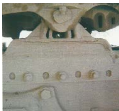
Cracked Fifth Wheel Support