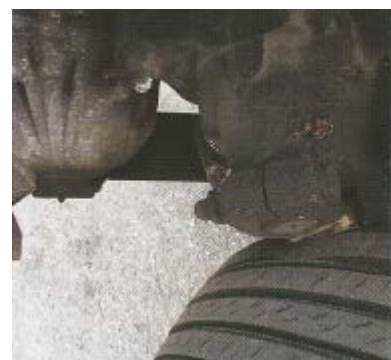
Tire in Contact with Vehicle