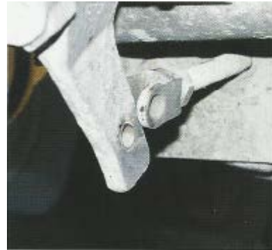
Defective Brake Pushrod