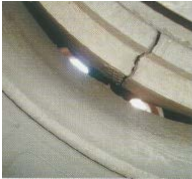
Cracked Brake Drum