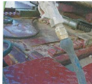
Bulging Brake Hose