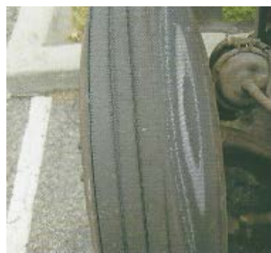
Tire Cord Exposed