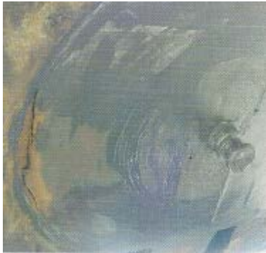
Cracked Upper Fifth Wheel