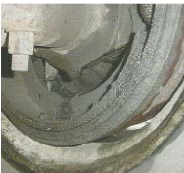
Oil Soaked Brake Pads