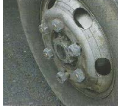
Loose Lug Nuts