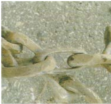
Excessive Wear on Safety Chain