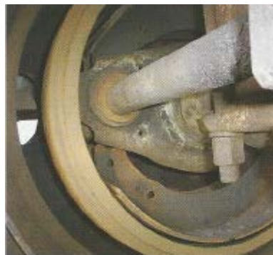
Brake Lining Less Than 1/4 Inch