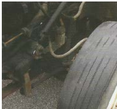
Tire < 2/32 Inch Tread Depth