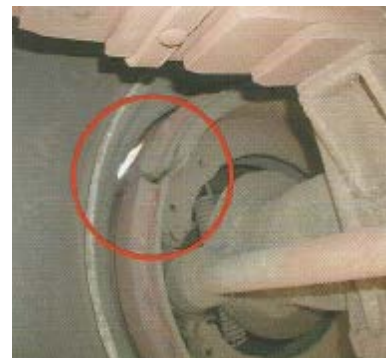
Cracked Brake Drum