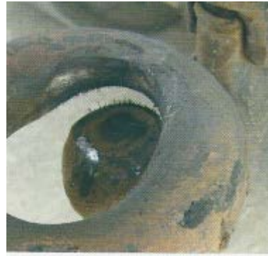
> 20% Reduction on Pintle Hook