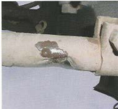
Damaged Steering Drag Link Welded Pitman Arm