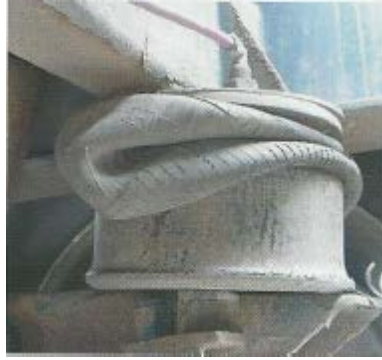
Deflated Air Suspension