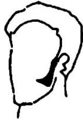
EXTENDED SIDE BURNS