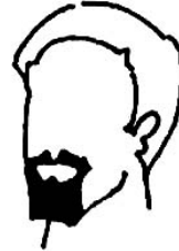
GOATEE & NARROW MUSTACHE