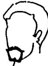
FU MANCHU MUSTACHE