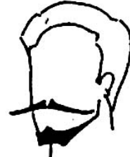
GOATEE & WIDE MUSTACHE